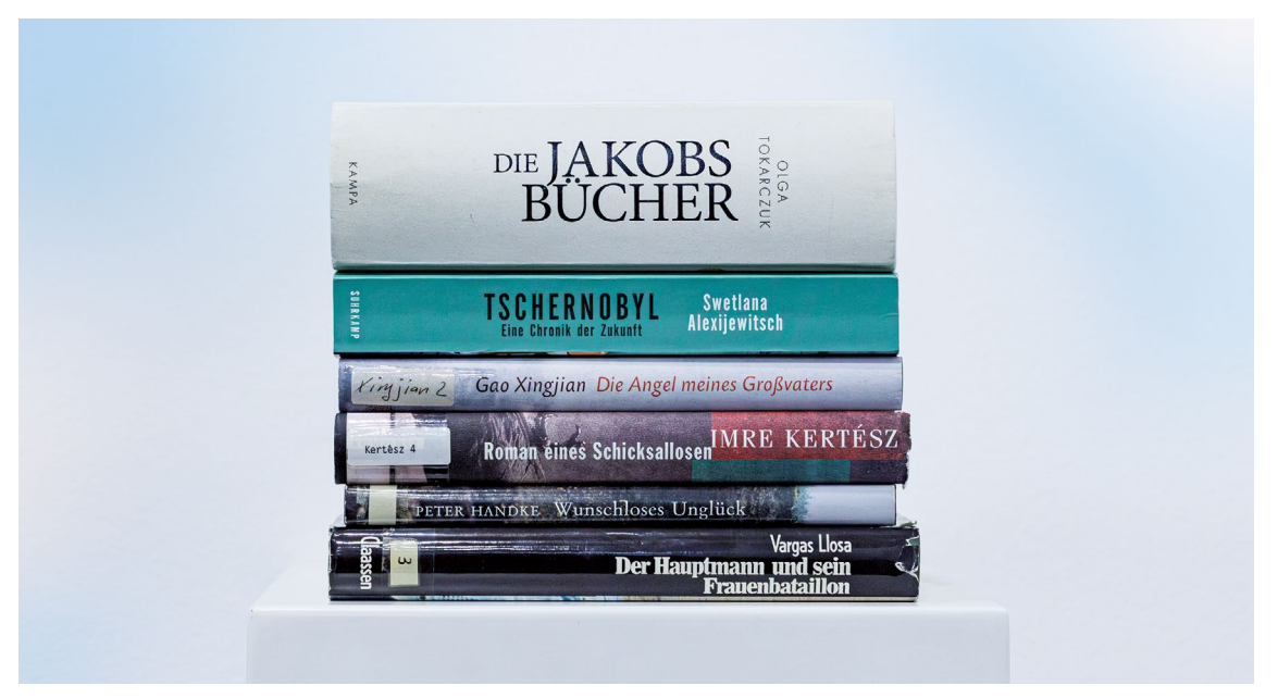
Honourd with Nobel Prizes: works by writers who have been supported by the DAAD's renowned Artists-in-Berlin programme.

We are convinced that our DAAD Strategy 2030 is setting the right course, enabling us to engage in funding, networking, and advising within the cooperation space of academia and science. Consequently, our strategy allows us to contribute substantially to transnational and sciencebased positive transformation at a personal, societal and global level over the coming years.