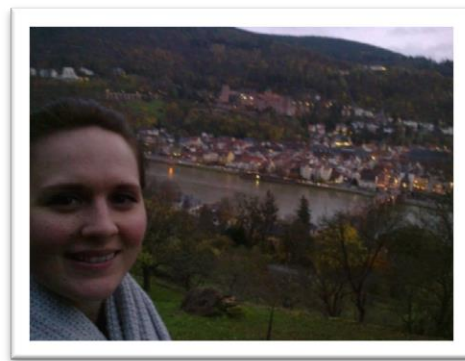
Views of beautiful Heidelberg!