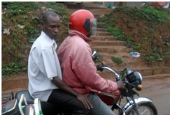
Boda boda transporting passenger in Kampala